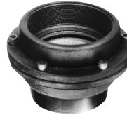
5" - 6"