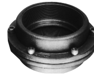
5" - 6"