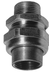
1/2" - 4"