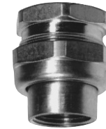
1/2" - 4"