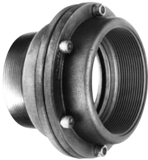
5" - 6"