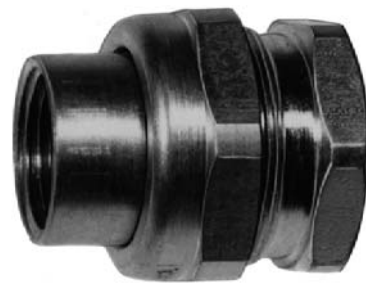
1/2" - 4"