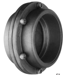
5" - 6"